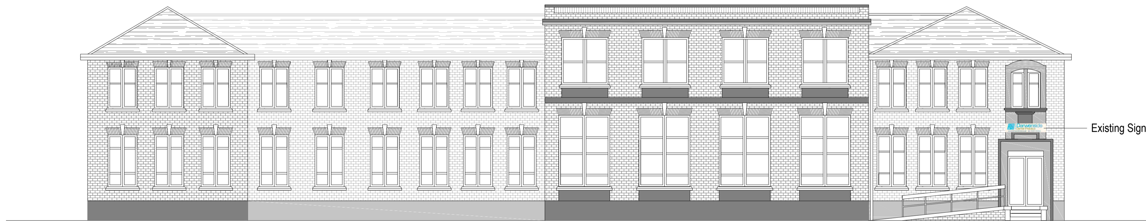
Darwen Side Dental Practice Existing South Elevation (to Union Street) Scale 1:100