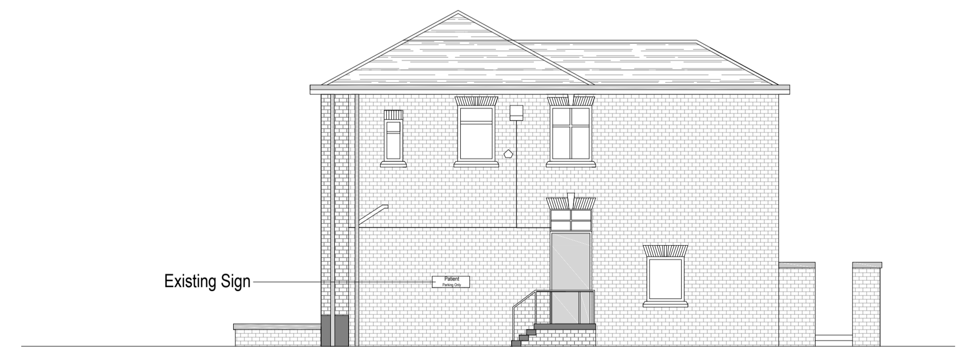
Darwen Side Dental Practice Existing East Elevation Scale 1:100

Darwenside Dental Practice Union Street, Darwen, BB3 0DA Existing Elevations